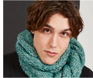
Wool | Yarns